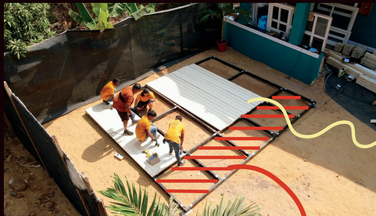
COTTAGE BASE FRAME