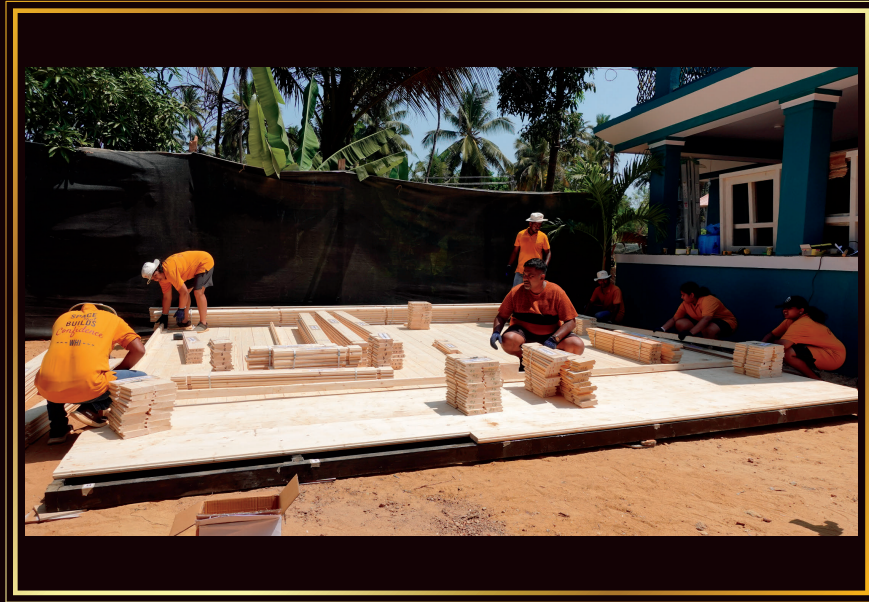
STAGE 7: START WITH THE BASE PLANK